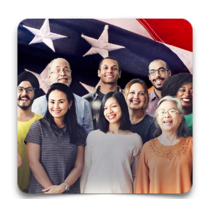
Civics (81 Lessons)