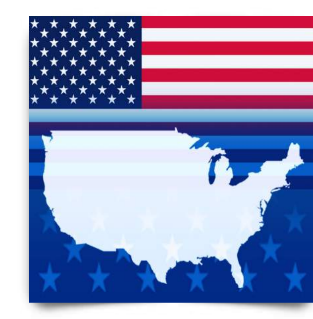
U.S. History Since 1877 (54 Lessons)