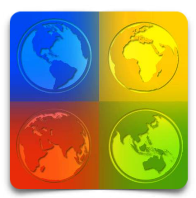
World Cultures/Geography (131 Lessons)