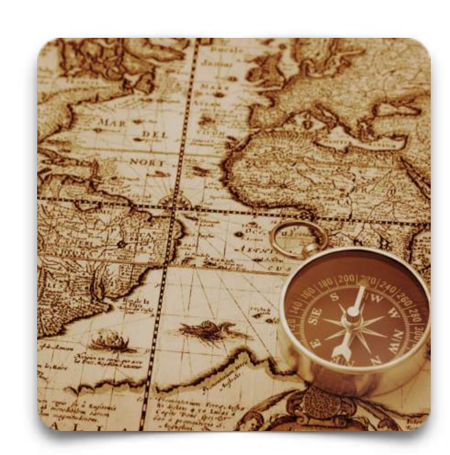
World History (75 Lessons)